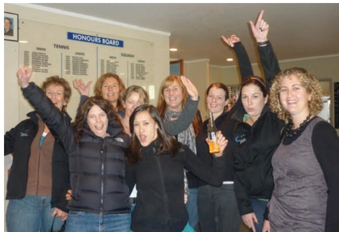
Herne Bay C Grade Team – Auckland Champions!