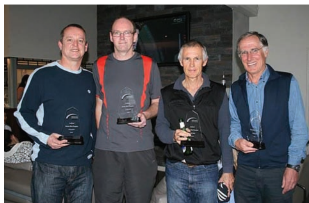
Auckland Masters Age Group Champions