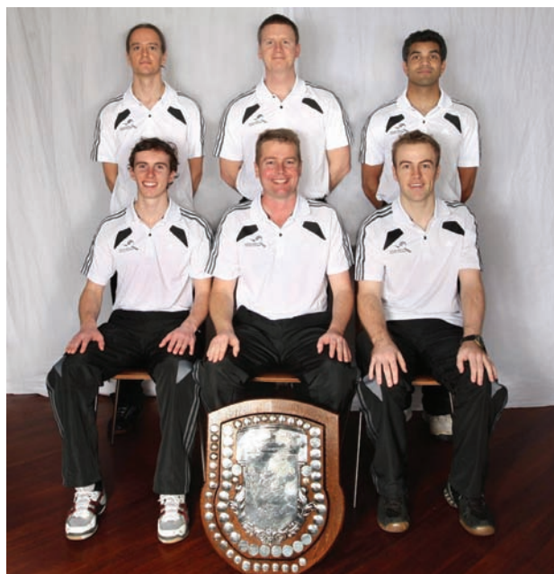
Remuera Cousin Shield Team