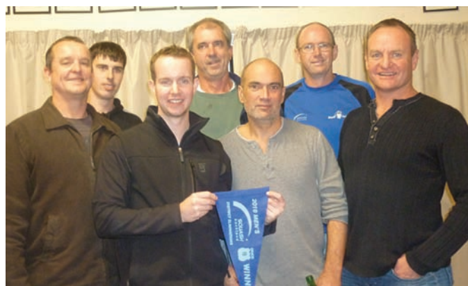
Panmure Mens B Grade Team