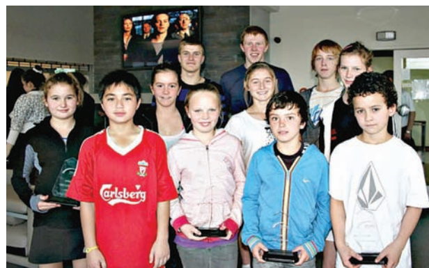
Auckland Junior Age Group Champions