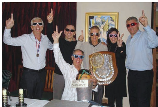
Remuera Masters Interclub Team