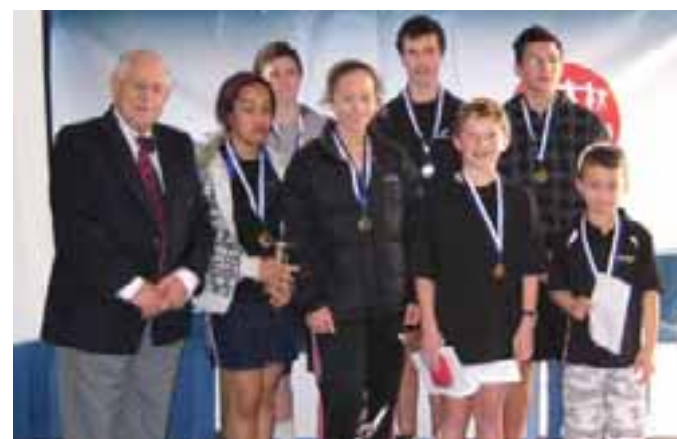
Auckland Junior Age Group Champs