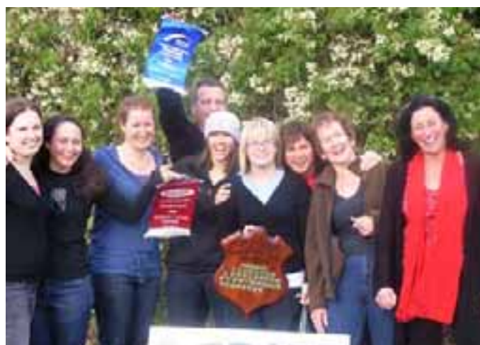
Herne Bay C Grade National Super Champs Winners