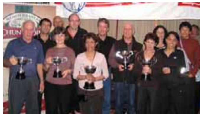
Auckland Masters Age Group Champs