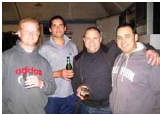
Franklin C Grade Super Champs Team

A decision by Squash New Zealand in 2008 saw the introduction of four player teams, rather than the traditional five. There was much talk regarding the four player team, particularly when results were two matches all and the winner was decided by game or points count back.