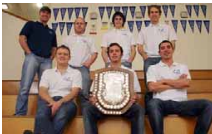
Herne Bay Cousin Shield Team

Champions: Herne Bay Rackets Club Herne Bay claimed the Cousin Shield title for the first time, beating top seeds Remuera 3-1 in the final.