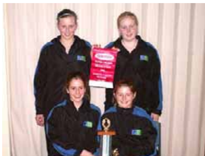
Eden Epsom F Grade National Super Champs Winners