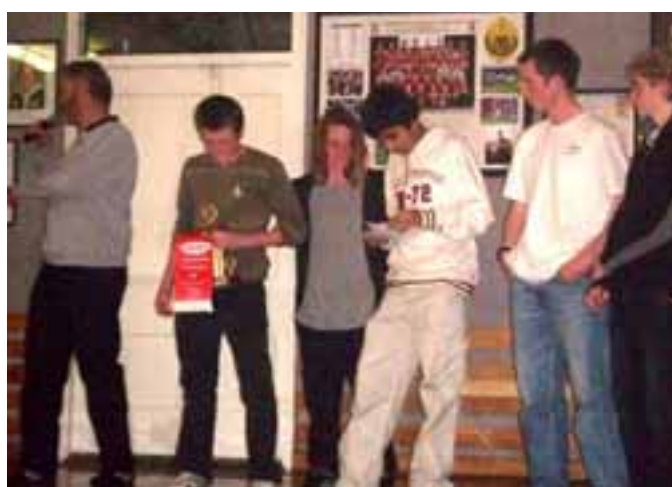
Eden Epsom F Grade Men's National Super Champs Winners